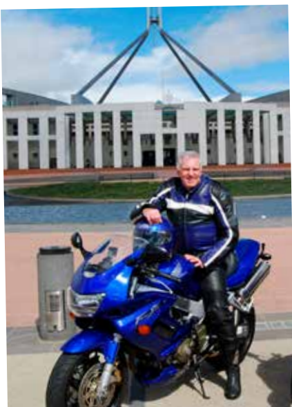
At Parliament House.

Motorcycling is exciting and enjoyed by many, but it comes with a higher degree of risk. At this time, I encourage all road users to remember to “look twice for bikes” and together, let’s make our roads a safer place for all.