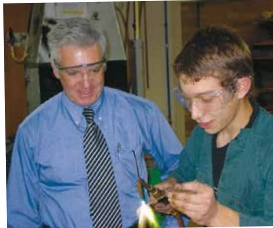
At Miller TAFE.

The Liberal Government has given private providers $5.4 billion regardless of graduation rates of students or whether the qualifications have led to employment opportunities. Now, the Australian Government is cutting $2.75 billion from vocational education.